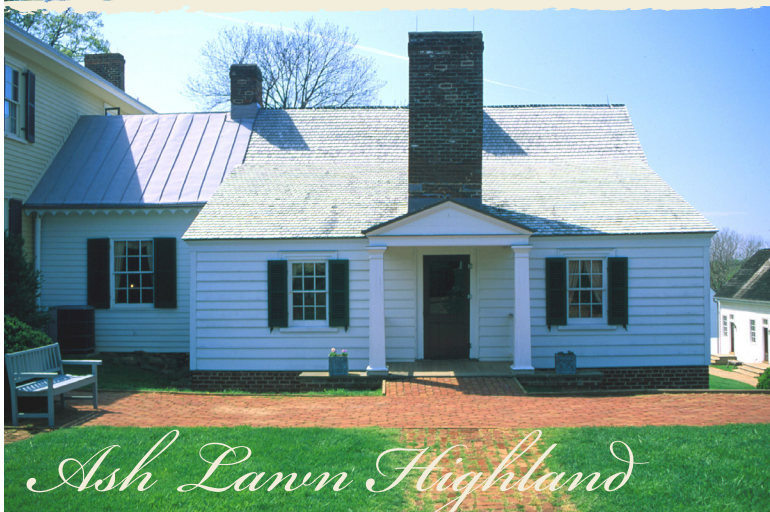
Ash Lawn Highland