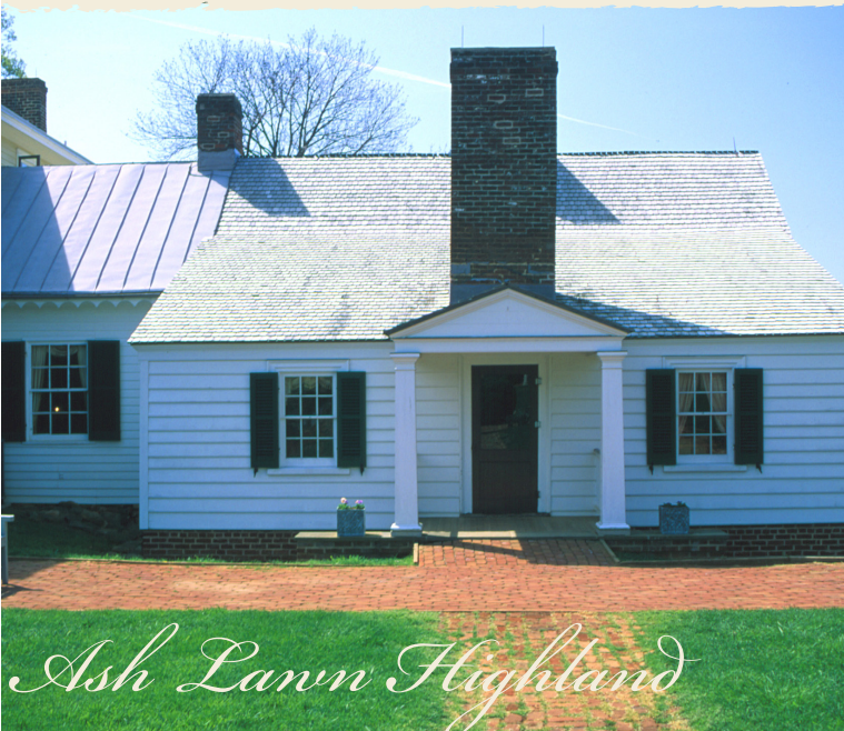
Ash Lawn Highland